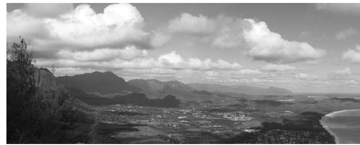
Mariner's Ridge.