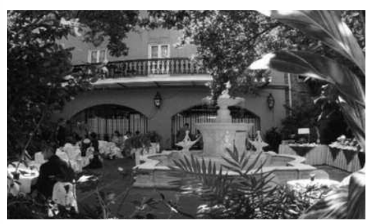
The courtyard of the Hotel Mason Dupuy in the French District of New Orleans, AGLP's host

The AGLP Booth at the Morial Center is Booth #932. Please note: convention hours have changed for this years Annual Meeting. The Booth and Exhibit Halls will be open 10:00am to 4:00pm Sunday through Tuesday (same time every day.) Please consider devoting some time to staffing the booth during your stay in New Orleans. AGLP dedicates substantial resources to this important outreach initiative, but your presence is what ultimately makes the difference.