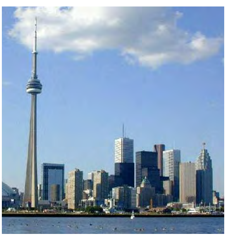
APA/AGLP Annual Meeting: Toronto, Ontario, Canada May 16 to 20, 2015

* Member-In-Training, General Member, Fellow, Life Member, Life Fellow