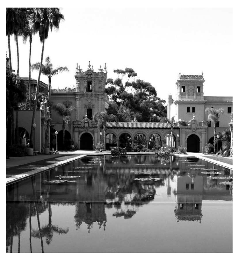
Balboa Park Reflecting Pool