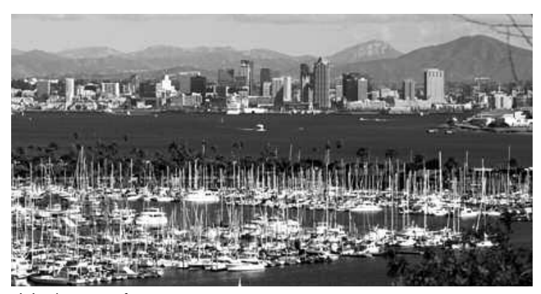
Skyline/Marina view from Pt. Loma