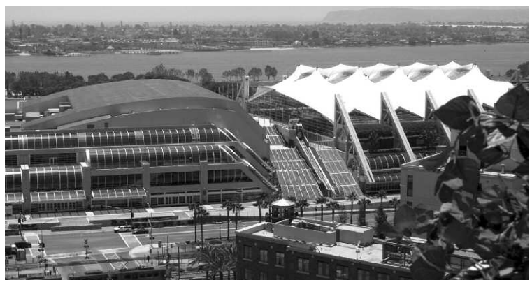
San Diego Convention Center