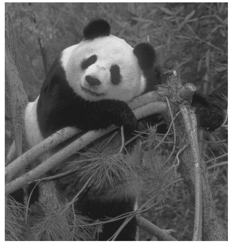
A Panda at the San Diego Zoo

* Member-In-Training, General Member, Fellow, Life Member, Life Fellow