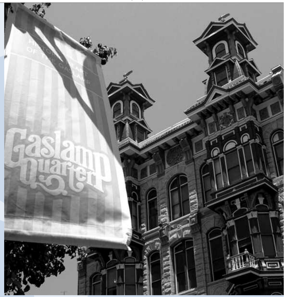
San Diego Gaslamp Quarter