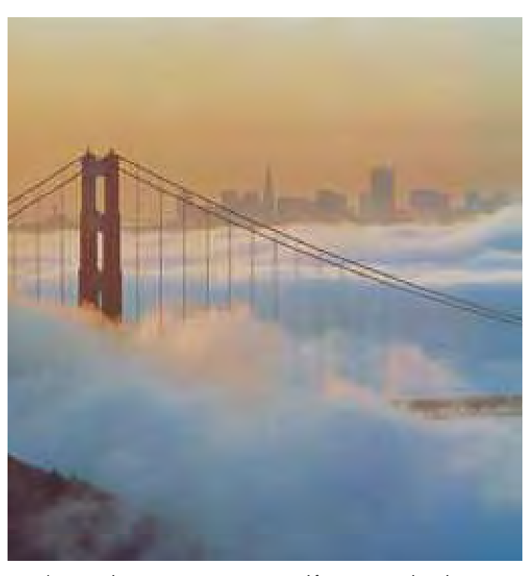
AGLP/APA Annual Meeting 2009; San Francisco, California, May 15 through May 21, 2009. Start making your plans today!

* Member-In-Training, General Member, Fellow, Life Member, Life Fellow