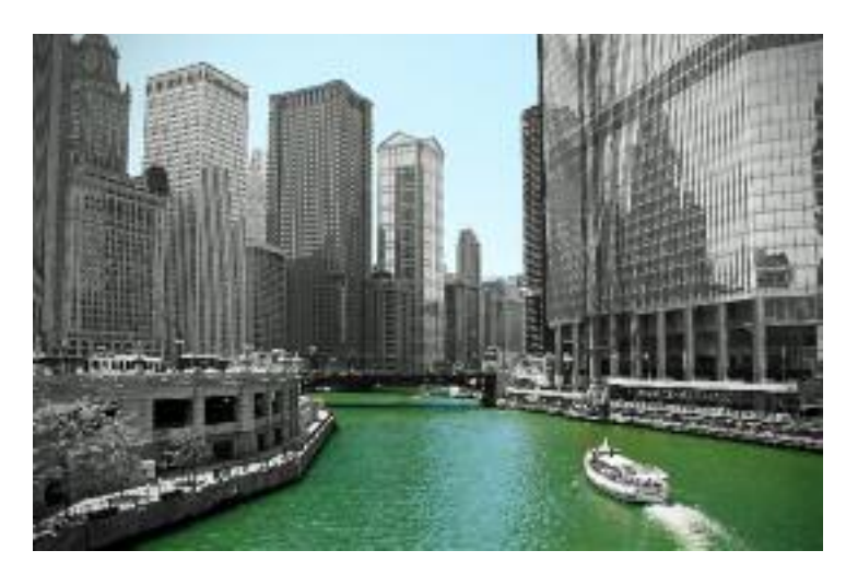
IPS 2018 Chicago THE MENTAL HEALTH SERVICES CONFERENCE OCTOBER 4 - OCTOBER 7, 2018

* Member-In-Training, General Member, Fellow, Life Member, Life Fellow