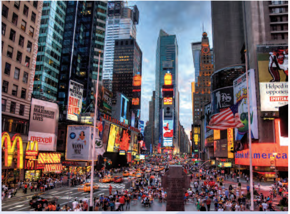
Times Square, New York City.