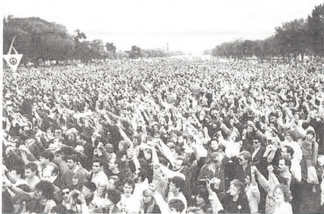
Capitol Mall during the March on Washington for Lesbian and Gay Rights, October 11, 1987. Story and pictures on Pages 6-7.