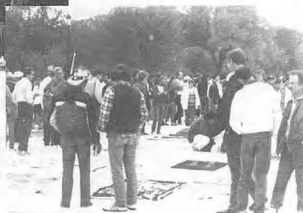
Viewing the Great Quilt memorializing victims of AIDS