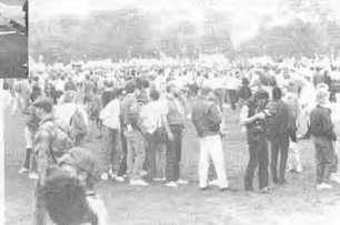
Staging Area at the White House Ellipse