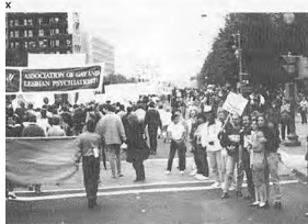
Pennsylvania Avenue on the way to the Capitol