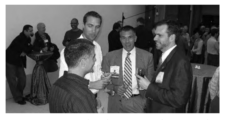
AGLP Opening Reception at The Equality Center: Human Right Campaign Foundation