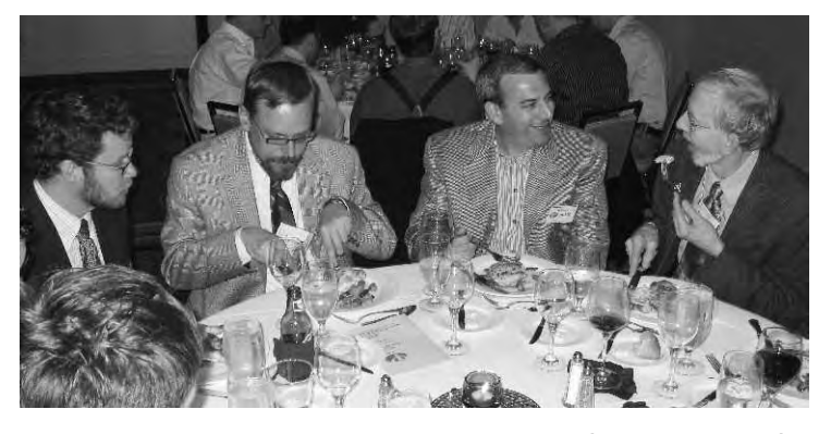
AGLP Closing Banquet attendees