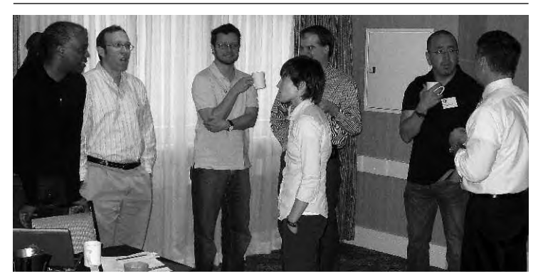
AGLP Board Meeting Was Held on May 5