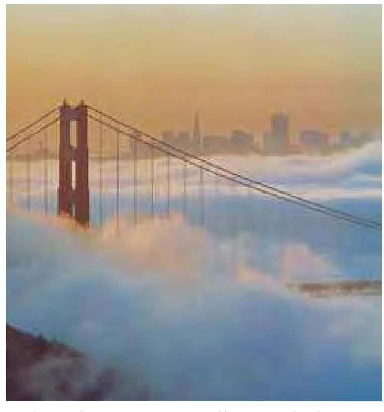
AGLP/APA Annual Meeting 2009; San Francisco, California, May 15 through May 21, 2009. Start making your plans today!

* Member-In-Training, General Member, Fellow, Life Member, Life Fellow