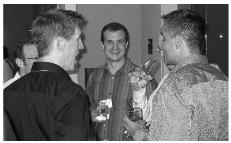
AGLP Opening Reception