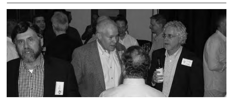
AGLP Opening Reception at The Equality Center: Human Right Campaign Foundation