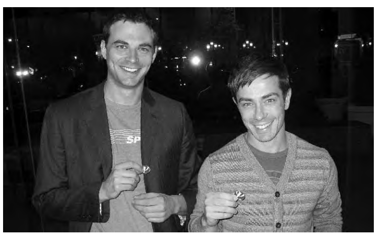
New members show off their AGLP pins