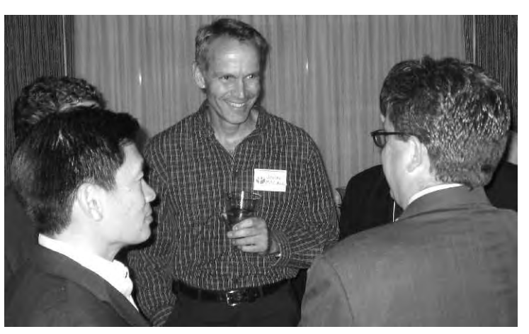
AGLP VIP Reception