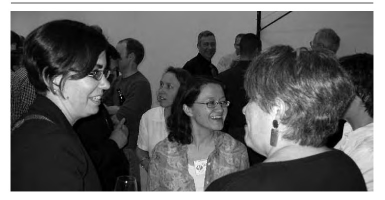
AGLP Opening Reception at The Equality Center: Human Right Campaign Foundation