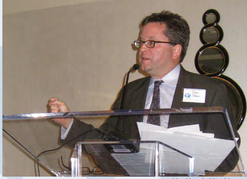
2008 AGLP Award Presentations