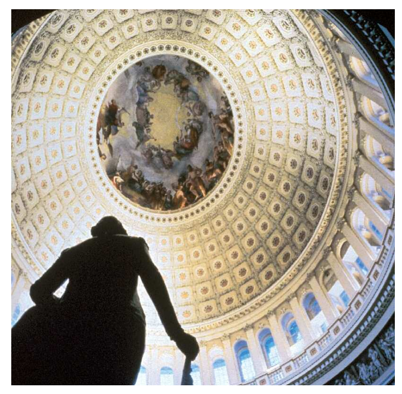
Start making your plans now for AGLP/APA in Washington, DC, May 2-8, 2008.

* Member-In-Training, General Member, Fellow, Life Member, Life Fellow