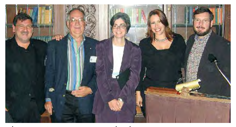
Film Project Committee Recognized at the Banquet