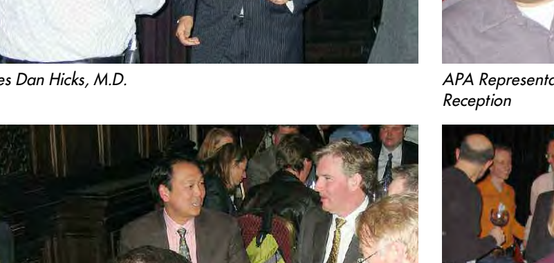
Attendees at the Closing Banquet