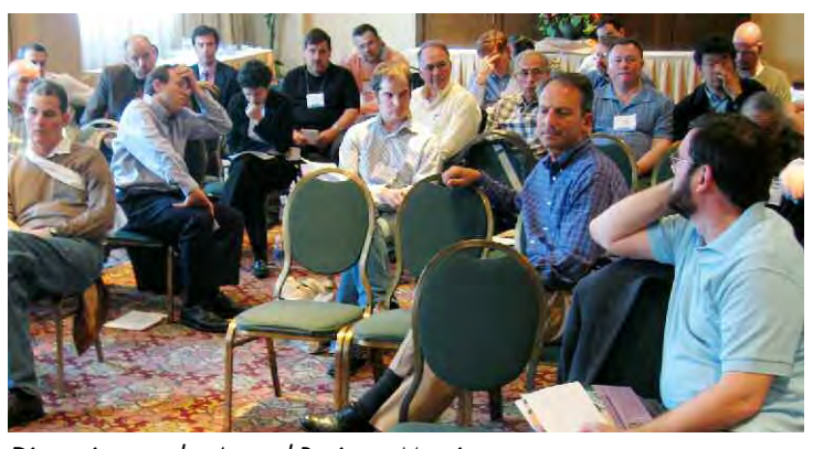
Discussions at the Annual Business Meeting