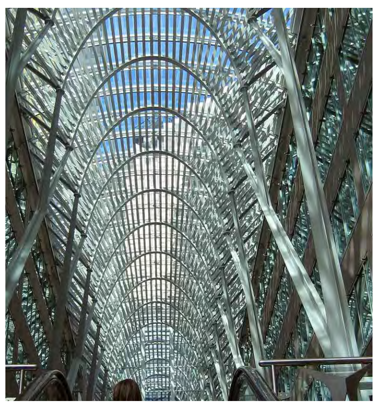
{\it Views~of~Toronto.}~{\it For~more~photos~see~page~4.}