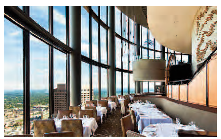
Sundial Bar at the Westin Peachtree