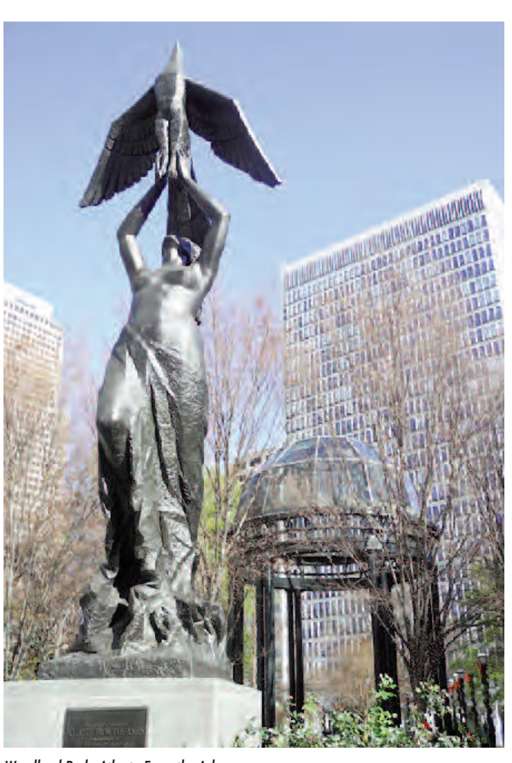
Woodland Park: Atlanta From the Ashes