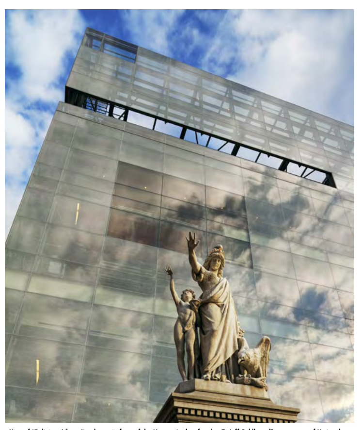
View of "Religious Liberty" sculpture in front of the Museum's glass façade, © Jeff Goldberg/Esto, courtesy of National Museum of American Jewish History.

The design of the National Museum of American Jewish History's new building has been informed by the idea that freedom is the essential humanizing value of American democracy and, thus, central to the narrative of Jewish American life. Facing Independence Mall is a glass prism expressing the openness of America, as well as the perennial fragility of democracy. Built at a cost of $150 million, the five-story, 100,000-square-foot space includes 25,000 square feet of exhibit space, an 85-foot-tall atrium and a 200-seat theater. The terra cotta and glass building is topped out with a beacon of light meant to symbolize themes of faith and patriotism.