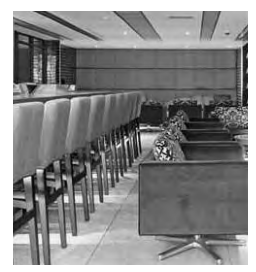
URBANA Hotel Palomar 2121 P Street, NW Washington, DC

AGLP National Office 4514 Chester Avenue