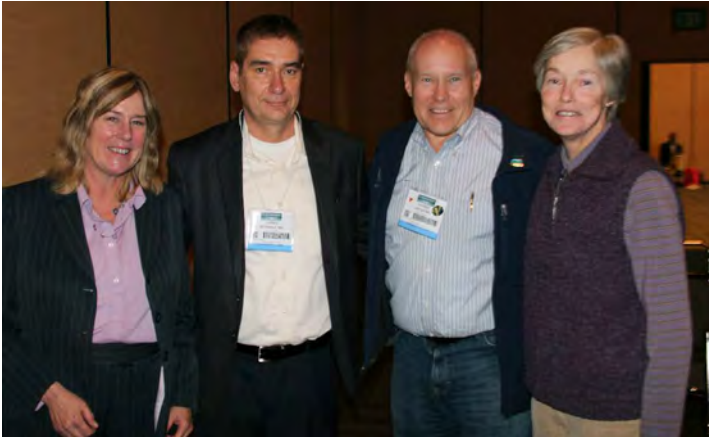
AGLP members and honored guests gathering at the Annual AGLP Awards Reception.