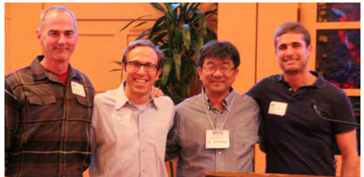
The San Francisco Local Arrangements Committee receive accolades for the work in support of the Annual Meeting.