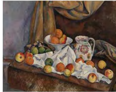
Cézanne Still Life

As you might imagine, AGLP has a number of events lined up during IPS, October 10-13, 2013, in Philadelphia.