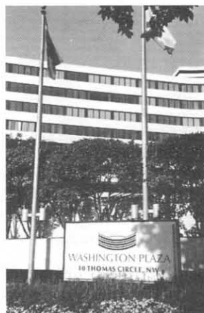
Next year's official AGLP Hotel