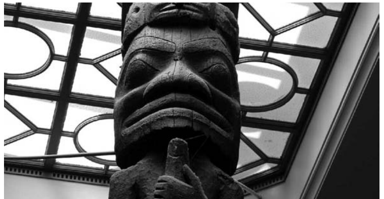
Royal Ontario Museum Totem