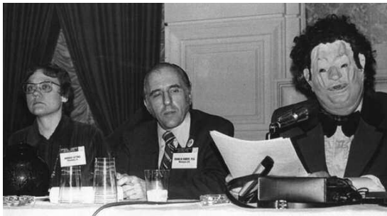
Dr. H. Anonymous at 1972 APA Convention

The Association of Gay and Lesbian Psychiatrists (AGLP) received a $15,000 challenge grant from the Gill Foundation, the nation's largest funder focused on lesbian and gay organizations and issues. The grant will support the creation of this new American Psychiatric Association award.