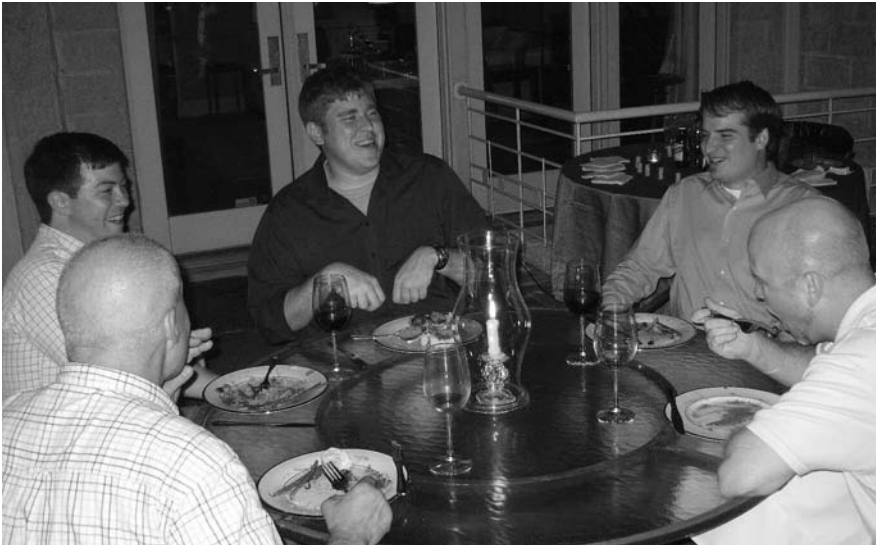
Dining Al Fresco at the Fall Meeting Welcome Reception