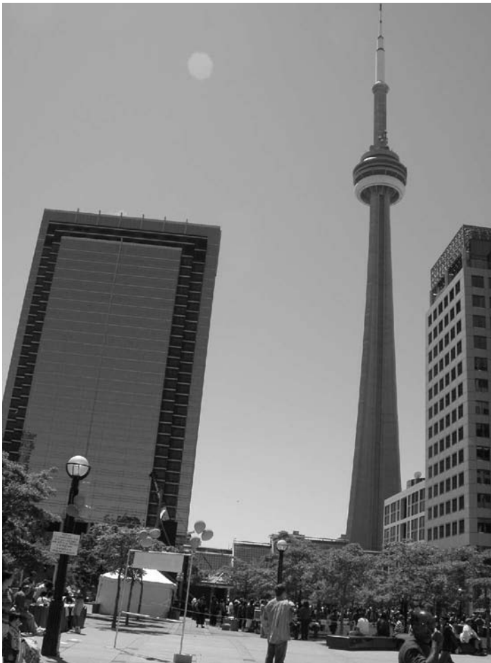
Toronto Space Needle