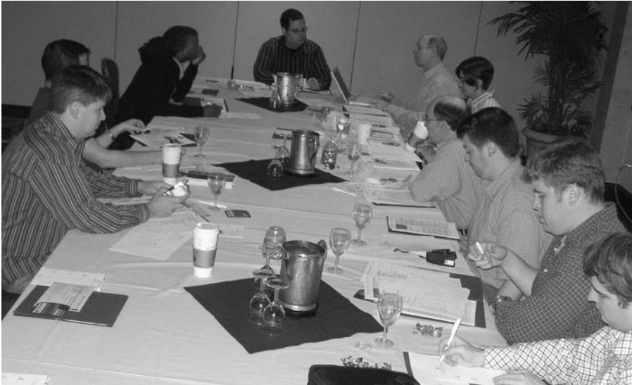
AGLP Fall Meeting