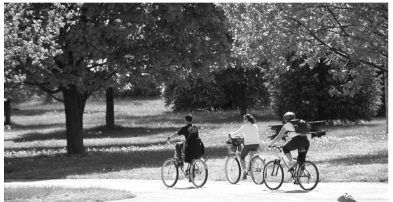
Toronto Island Cyclists