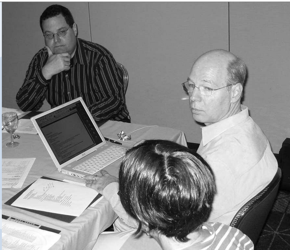
The AGLP Executive Team Conferson on the budget Minutes and more coverage of the meetings begins on page 12