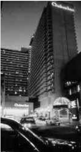
The Delta Chelsea Toronto Hotel

B egin your planning for AGLP 2006 Toronto now! Aglp's host hotel will be the Chelsea Hotel Toronto, located just one block from Church Street. The Gay village is on Church St. between Gerrard and Charles Streets. The Village is centered around Cawthra Park, behind the 519 Church Street Community Centre. The AIDS Memorial is situated in the park and is well worth a visit. Church Street is lined by the bars, restaurants and small shops. the address of the hotel is 33 Gerrard Street West, Toronto, ON M5G 1Z4 Canada.