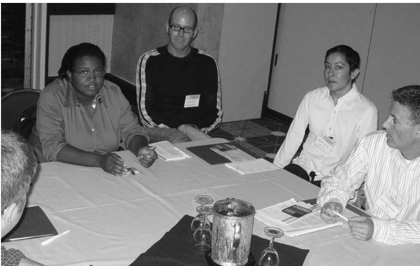
APA Lesbian Gay and Bisexual Committee joined the meeting