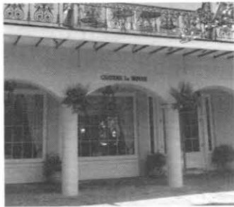
Official AGLP Hotel in New Orleans