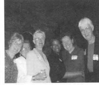
More women at the Lesbian Dinner