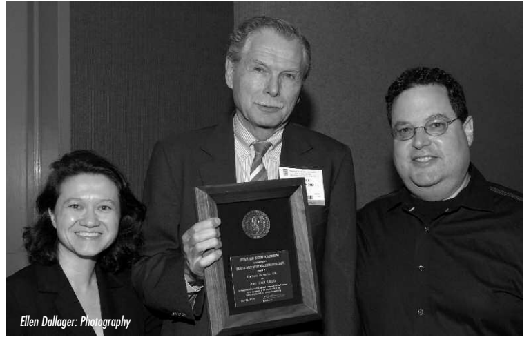
Ellen Dallager: Photography