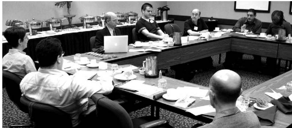
◀ AGLP Board Meeting