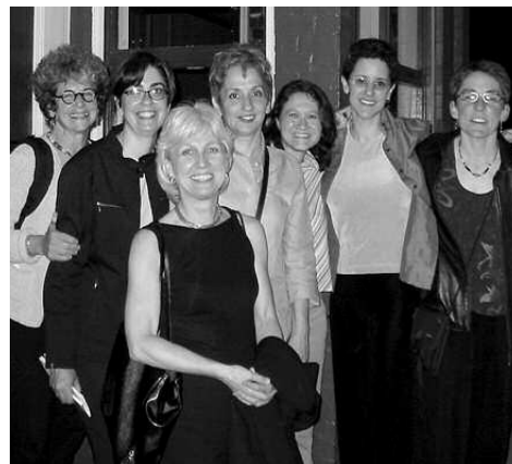
◀ Women's Dinner Attendees