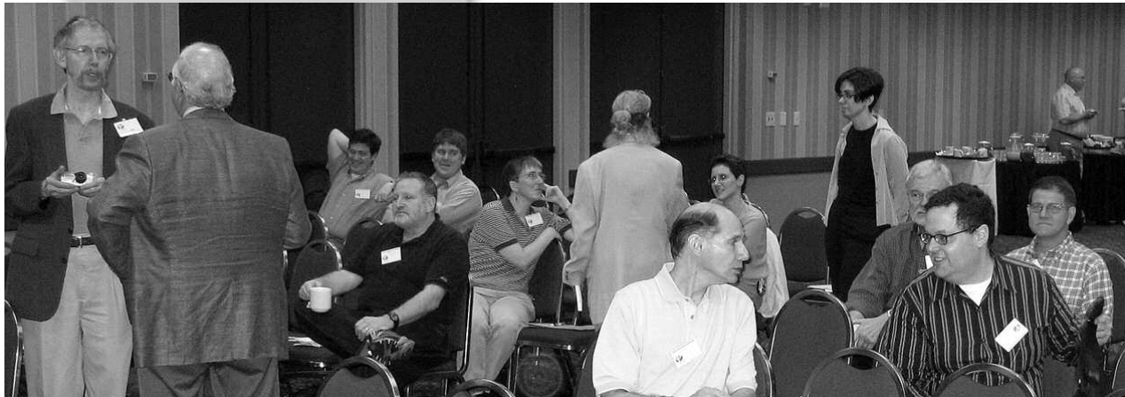
Attendees at the Saturday Symposium