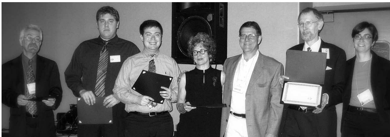
Atlanta 2005 Local Arrangement Committee