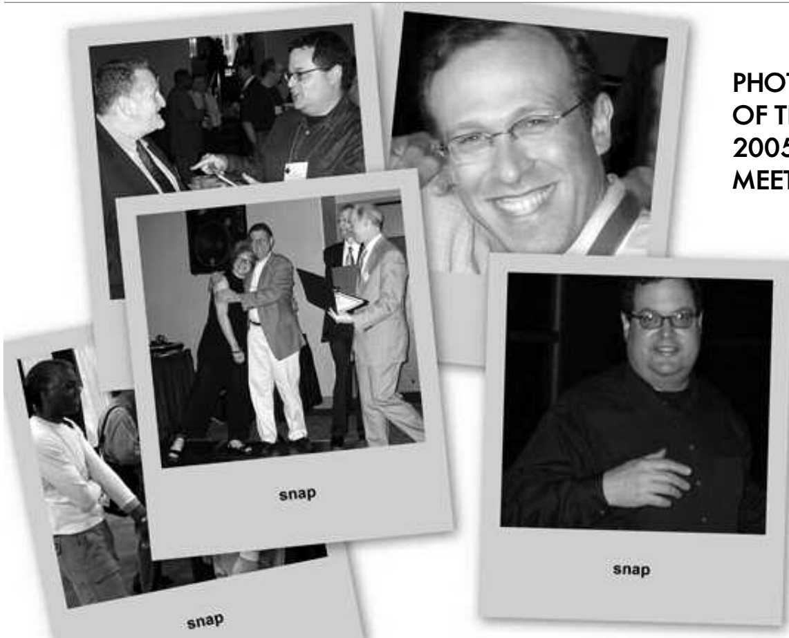
PHOTO MEMORIES OF THE ATLANTA 2005 ANNUAL MEETING