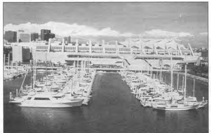
San Diego Convention Center