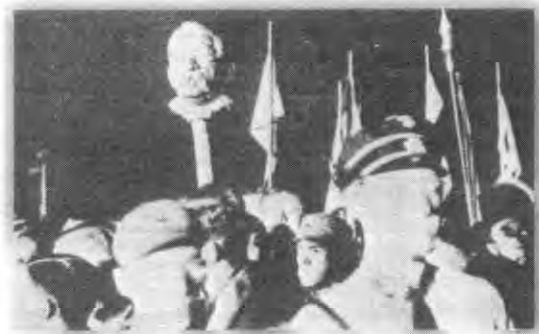
Nazis carry bust of Magnus Hirschfeld in torch-light procession.