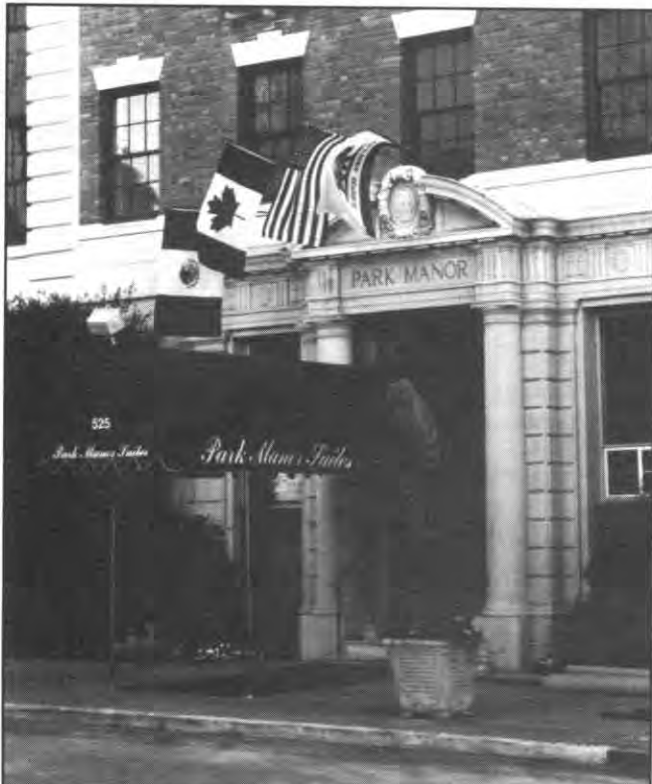
The Park Manor Hotel Site of the AGLP Pre-Convention