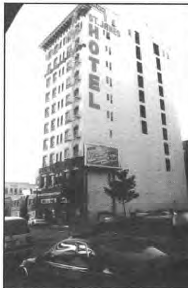
The St. James Hotel/Ramada Inn Site of the AGLP Hospitality Suite