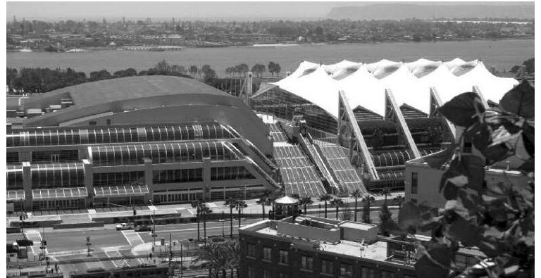
San Diego Convention Center