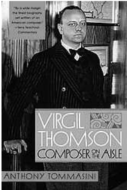
Virgil Thomson: Composer on the Aisle, WW Norton, 1997