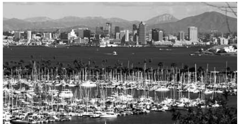
Skyline/Marina view from Pt. Loma

And while you are at the San Diego Convention Center, plan to visit the AGLP Booth, Number 334, and please consider volunteering to staff the booth for an hour-long session. Sign-up sheets will be available at the booth and at the Hospitality Suite.