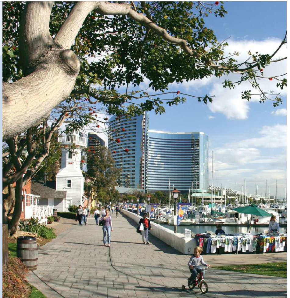
Seaport Village, San Diego