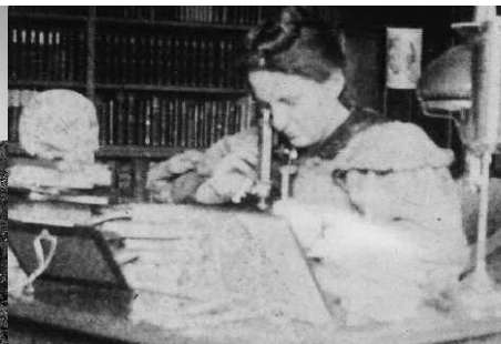
Gertrude Stein in Medical School