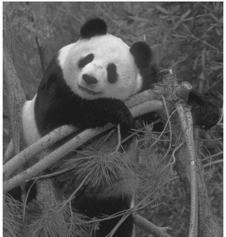
A Panda at the San Diego Zoo

* Member-In-Training, General Member, Fellow, Life Member, Life Fellow