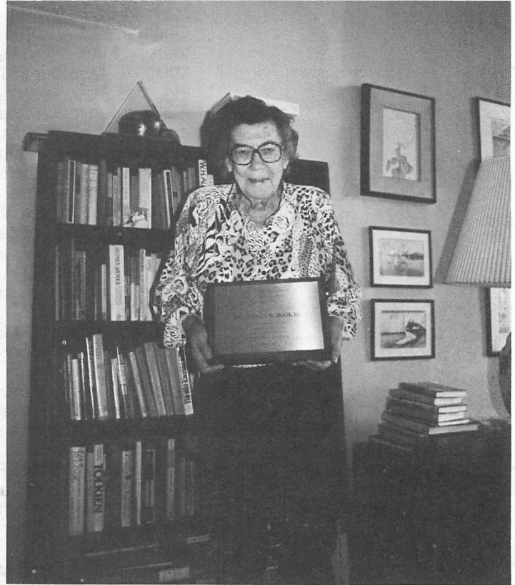
Evelyn Hooker, Ph.D. receives the 1990 Annual Distinguished Service Award in her home in Los Angeles.