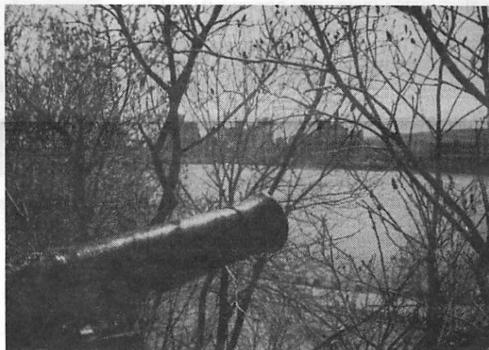
As the Montreal skyline fades into the distance, AGLP prepares for San Francisco. (Stories inside)