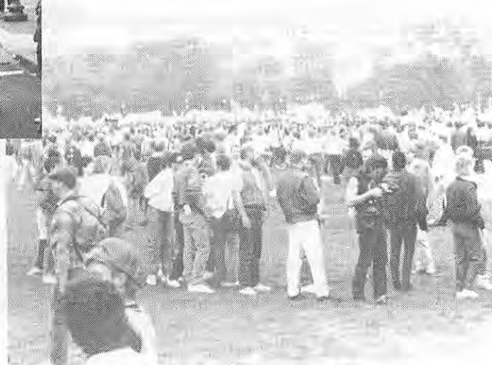
Staging Area at the White House Ellipse