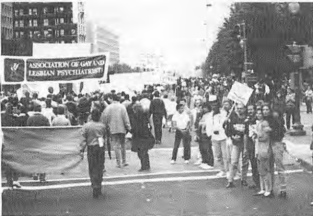
Pennsylvania Avenue on the way to the Capitol