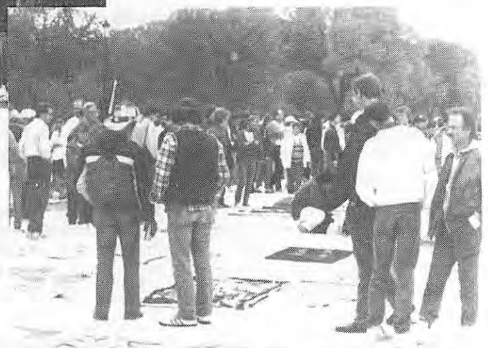
Viewing the Great Quilt memorializing victims of AIDS