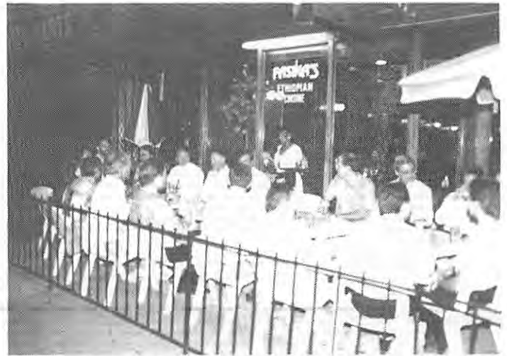
Fall Meeting participants at Fasika's

It was truly a magnificent march - covered on Nightline , "Person of the Week," and the front page of many newspapers across the country. It was probably the largest collection of gay people in history. We must not let the spirit die.